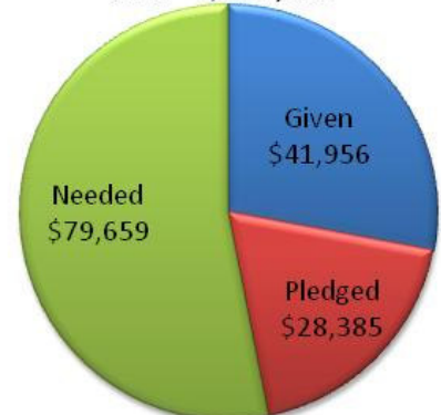
2011 Budget Circle Goal = $150,000